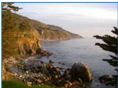
Big Sur Coast